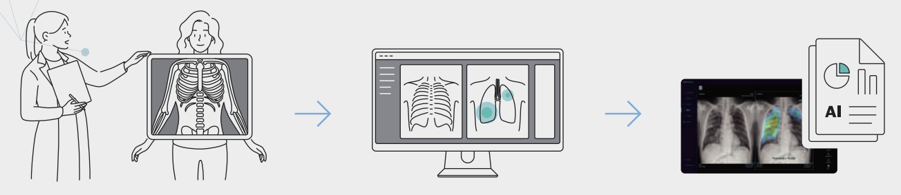
Take Chest X-Ray